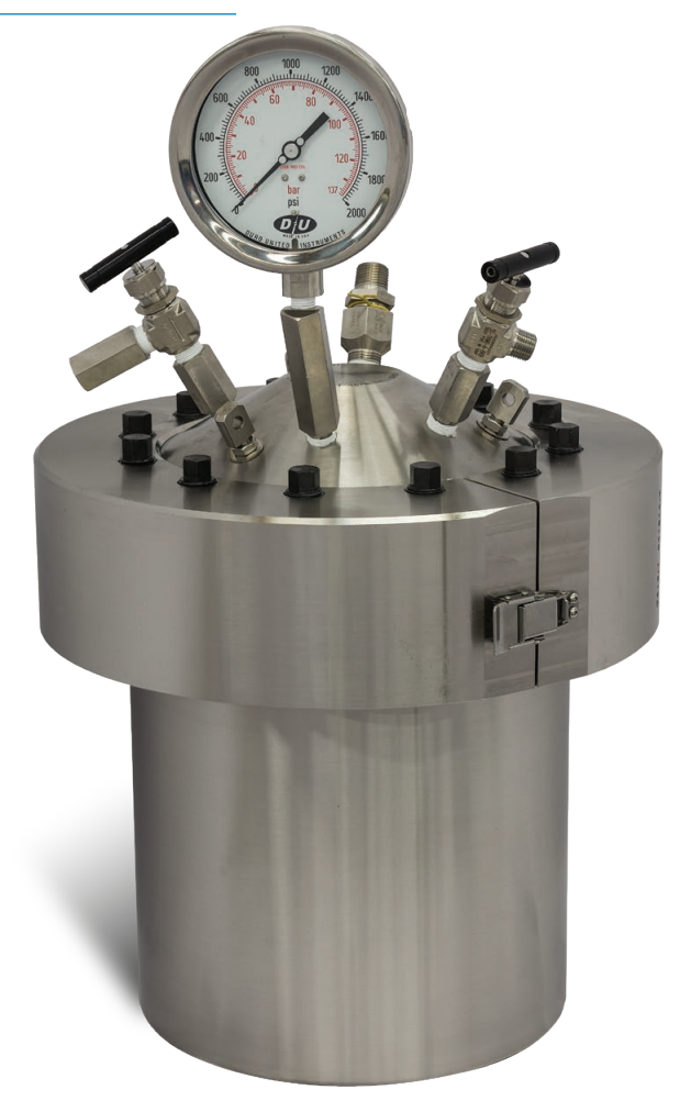
Model 4675-10L General Purpose Vessel