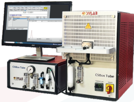
CSBox Tube CS Analyzer

CSBox Tube is supplied with a comprehensive user friendly software which includes statistic reports, diagnostics features and other functions.