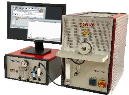
CSBox TubeHT CS Analyzer