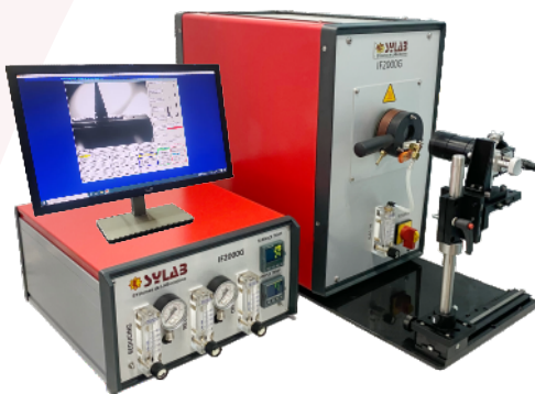
Ash Fusion Analyzer