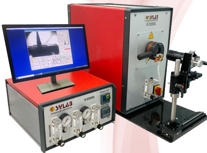
Ash Fusion Analyzer

ASTM D 1857 ASTM E 953 AS 1038.15 ISO 540 CEN/TS 15370-1