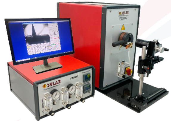
Ash Fusion Analyzer